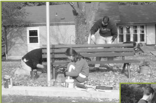
Des Peres Rotary members volunteered on 11/10/07. They stained two park benches and raked leaves on the main Rainbow Village campus.