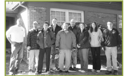
Colliers Turley Martin Tucker employees volunteered on 11/16/07. They raked leaves and put in edging at a community home.