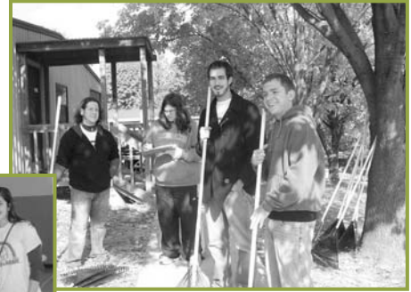
St. Louis University Students on 10/27/07 'Make a Difference Day' raked leaves and took down decorations on the main Rainbow Village campus.