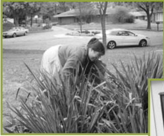
Ellisville Methodist Church Special Needs Ministry Group volunteered on 10/13/07. They stained the fence and weeded at a community home.