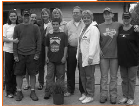
Commercial Real Estate Woman (and families)