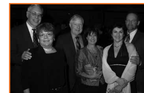
Brown Smith Wallace