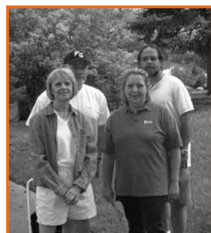
Ellisville Methodist Church