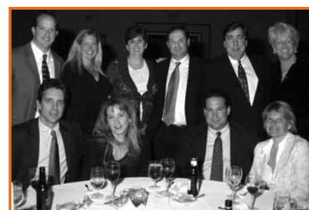
General Credit Forms