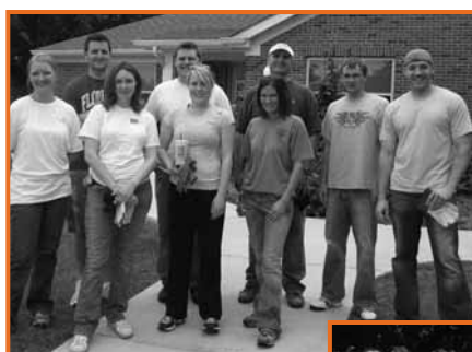
Colliers Turley Martin Tucker