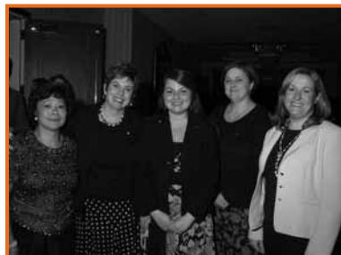
First National Bank