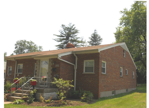
St. Louis City